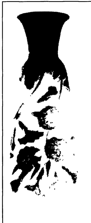
Signed Galle' triple overlay Cameo vase.

The French always signed their pieces, unlike the English and Americans.