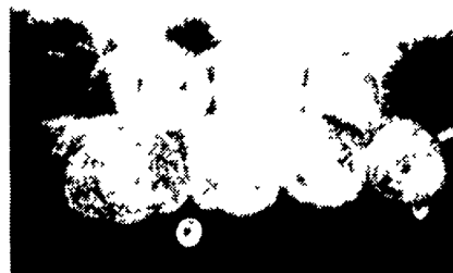
Carries up to 14 bales