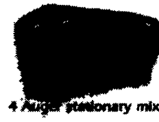
4 Auger stationary mixer