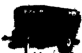
4 Auger mobile mixer