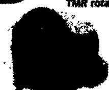
TMR rotative mixer