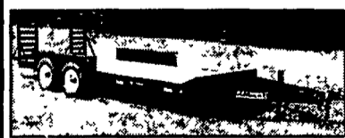
Skid Steer Trailers