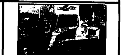
1999 ASV 2810, gp bucket, auxiliary hydraulics, 24" tracks, v.g. condition, 790 hours, work ready. $21,500