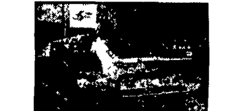
1998 Komatsu D41E-6, OROPS, 6 way blade, v.g. undercarriage & condition, 2550 hrs., work ready $42,500