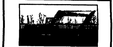
1984 John Deere 690B, 36" bucket, standard stick, joystick controls, v. g. undercarriage & condition, work ready, $19,000