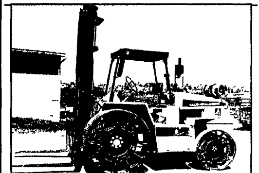
Allis Chalmers 700 21 Ft. Tractor Lift, Motor Rebuilt, LP Gas, Steel or Rubber Wheels Available. A-1 Condition.

Sam's MECHANICAL SERVICES Fork Lifts Sales - New & Reconditioned Rental Leasing Specializing In Fork Lifts Skid Loaders Repairs