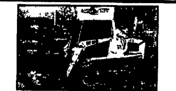
2000 ASU 4810, gp bucket, hi-flow, auxiliary hydraulics, rear brush guards, v.g. undercarriage & condition, 769 hrs., work ready, $28,000