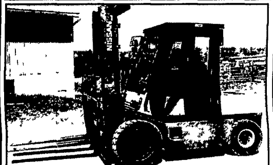
1994 Nissan Diesel, 6000 lb., Pneumatic Tire, 3 Stage Mast, Sideshifter, Full Cab.