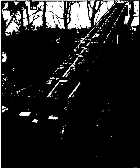
Hay & Corn Elevator with Heavy Duty Chain and Sturdy Paddles

Well Balanced, Ruggedly Built For Many Years Of Trouble Free Service