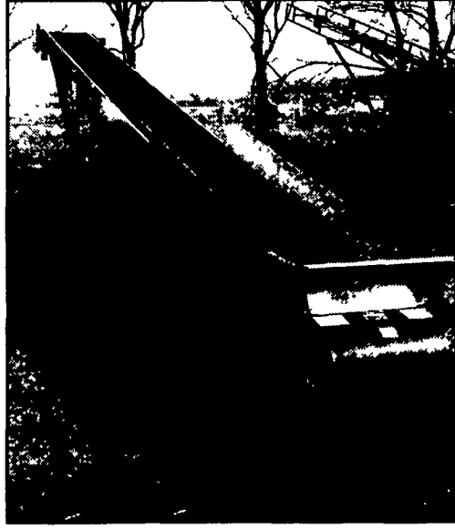
Conveyor with Durable Belt for Loose Material – Mulch, Sawdust, Poultry Litter, etc.