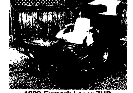
1999 Exmark Laser ZHP 573 hrs., Kohler Commando 18 hp Engine, 48" deck, 6 hp vacuum catcher and weight Kit $5,900

5' Woods M5 Rotary Mwr 5' Bushhog Rotary Mwr 6' Woods Pull Type Rotary 6' Arps 3 pt Blade