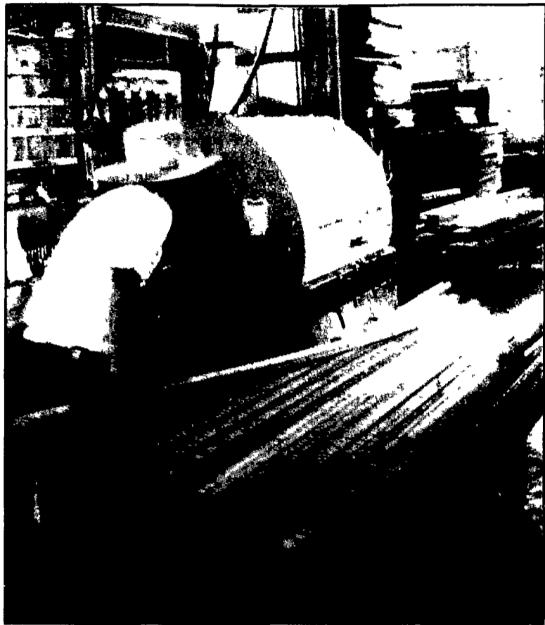
Workers assemble milled handrails made of red oak during the tour.