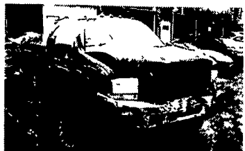
'99 F250 X/CAB 541C, A/T, Pickup Bed w/Utility Drawers. Needs Nose . . . . . $12,500