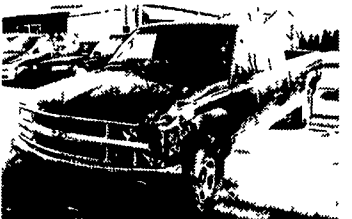
'00 F250 REG. CAB XL, Stick, 35K. Front Mt. Over Frame . . . $10,500