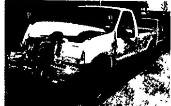
'97 CHEV. X/CAB, A/T, Silverado Trim, 100K, 6.5 Turbo Diesel. Left Front Damage . . . . . $5,900