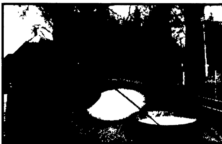
Testing milk in Moldova.

with the Citizens Network for Foreign Affairs. We drove three hours today north of the capitol city of Chisinau to a farming village of Cuconesti-Noi. That is where my assignment will be. This village is located in Northwest Moldova, just across the border from Romania. Recall that the country of Moldova is situated between both Romania and Ukraine.