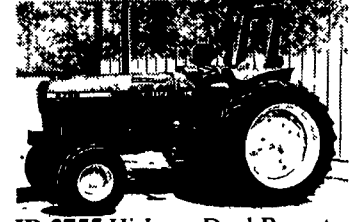
JD 2755 Hi-Low, Dual Remotes, 540/1000, 4,200 Hrs.