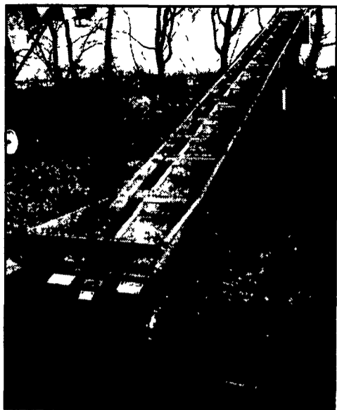
Hay & Corn Elevator with Heavy Duty Chain and Sturdy Paddles

Well Balanced, Ruggedly Built For Many Years Of Trouble Free Service