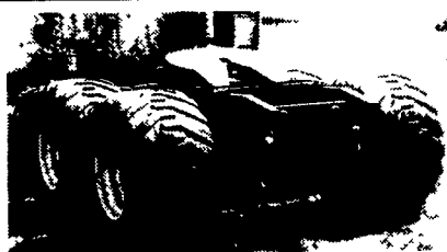
Flotation Tires Budd And Spoke Application