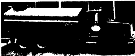
Generation II Custom Truck Tanker

275 Goodhart Road, Shippensburg PA 17257 Interstate 81, Exit 29, 174 East, Goodhart Rd Right Financing & Trucking Available (717) 532-8601