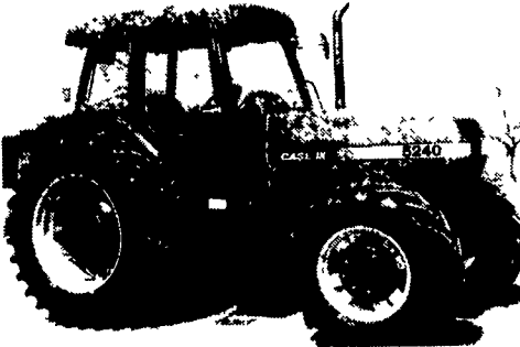
'96 CIH 5240 4x4 Cab, Air, Power Shift, Bar Axle, Creeper Gear. 4800 Hrs. Nice $26,500