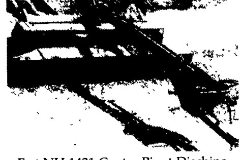
Fiat NH 1431 Center Pivot Discbine, 13 Ft., Low Wear $10,900