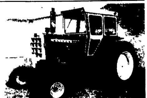
Oliver 1950 GM Diesel $7,500