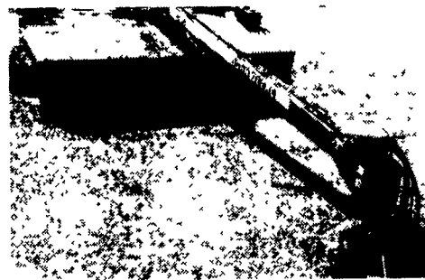
JD 945 13 Ft. Center Pivot Discbine w/Impeller $12,500