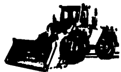
Syracuse (Evenings) (315) 637-8912