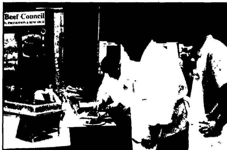
Judges deliberate during the third annual "Veal Cook-Off Challenge."