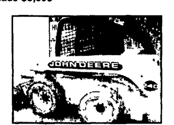
JOHN DEERE 240 SKIDLOADER, 3 cyl, 53HP disel, auxiliary hydros HP, 66 lo-pro bucket, 970 hrs SALE ONLY $10,995

CALL FOR HOURS & DIRECTIONS • ALL EQUIPMENT STORED INDOORS • NEWPORT, PA