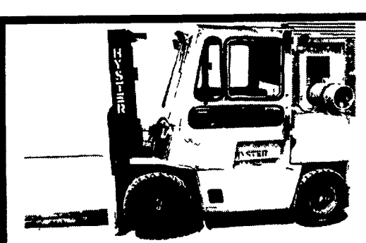
HYSTER H80XL, 8,000# Capacity, Pneumatic Tires (90%), LP Gas, Auto Trans. 2 Stage Mast, 4' Forks, Runs Good

Heavy Equipment Loader Parts, Inc. 10070 Allentown Blvd , Grantville, PA 17028 No Sunday Calls (717) 469-0039