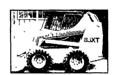
CASE 85XT SKIDLOADER, 77hp, 72 bucket, auxlilary hydros, 1350 hrs, SALE ONLY $16,995