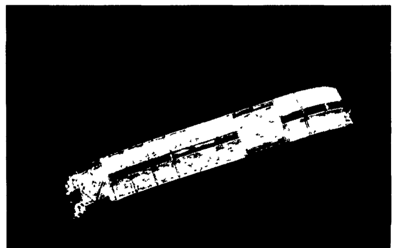
Diamond and sapphire bracelet from the 1930s sold for $5,750.

One record setting work was the painting titled "South Seas" by New Hope artist Joseph Meierhans. The gilt frame also hand-crafted by the artist complemented this full-bodied piece. The painting measured