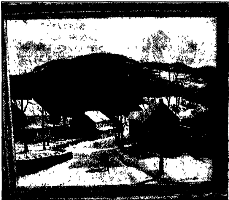
Winter landscape with village houses with figures sledding on street, oil on canvas, 30x36-inches by John E. Berninger, Pa., sold for $22,500.

The Alderfer Auction Company is located at 501 Fairgrounds Road in Hatfield, PA 19440, and can be contacted by phone (215) 393-3000 and by fax: (215) 368-9055. Alderfer's website is www.alderferauction.com .