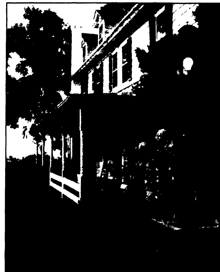
The Boxwood Inn is one of nine stops featured during the annual Kitchen Kaper Tour. Tickets are limited and should be ordered in advance for the opportunity to tour residences, sample food served by area restaurants, and view indoor and outdoor floral displays.