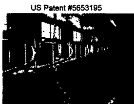
US Patent #5653195

The World Leader in Cow Comfort Over 1.2 million mattresses sold worldwide!