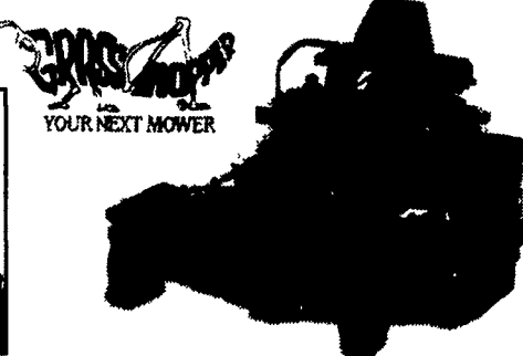
YOUR NEXT MOWER

YOUR NEXT SKID STEER MIGHT NOT BE A SKID STEER