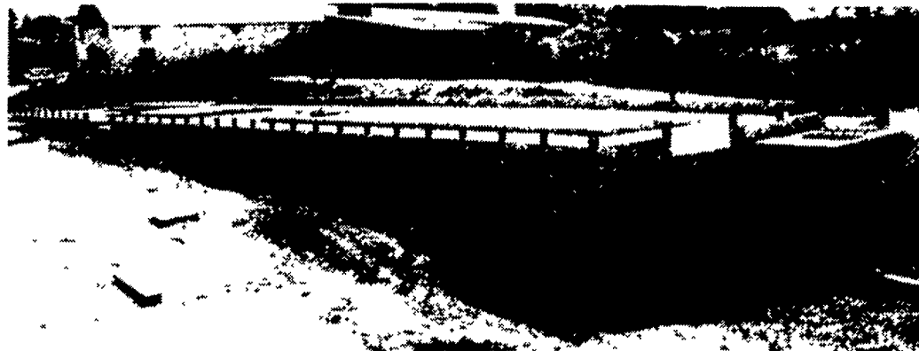
Slatted Pit For Free Stall Barn

Round or Rectangular, In-Ground or Above-Ground