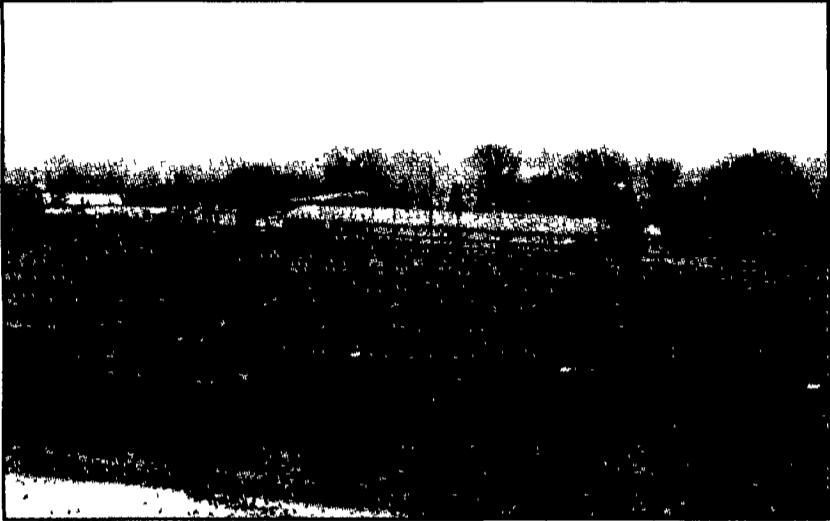
The 50-acre farm includes 14 paddocks for turnout.

of a three-way partnership that also includes Daryl Heller.