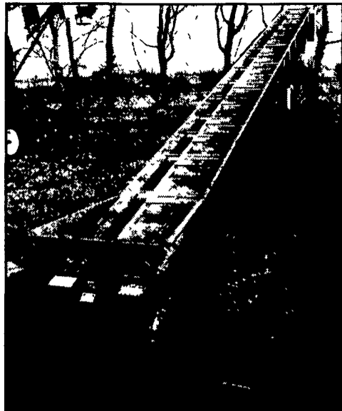
Hay & Corn Elevator with Heavy Duty Chain and Sturdy Paddles

Well Balanced, Ruggedly Built For Many Years Of Trouble Free Service