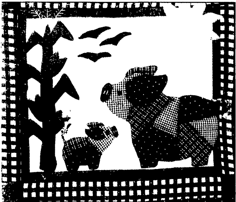
These little piggies went to market... to benefit the Relief Sale. Rachel Horst and Marie Eby teamed up to create "Crazy Pigs."

The MCC's relief sales or festivals are usually conducted over a weekend and often include an auction of everything from quilts and artwork, to wooden toys and