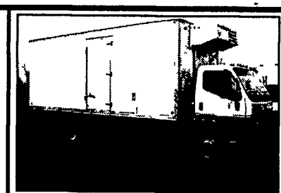
00 Mitsubishi FH

475 Cat w/Jake, 18 Spd, 46000# Rears w/tull lockers on Air Trac Suspension. 12860# Front, 241" WB, 4 33 Ratio, (10) alum wheels w/11R245's, new drive tires, dual stacks and breathers, 3 line wet kit w/split tank, 241,000 miles, balance of warranties, dark green