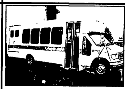
1997 Ford E450 Superduty Turtle Top, 21-Passenger w/Wheelchair Lift. 7.3L Powerstroke Dsl., Rear Air Conditioning, 14050 GVW, 66,800 Miles, White. #4380

System, Rear Luggage Storage, 43,000 M<sub>1</sub>