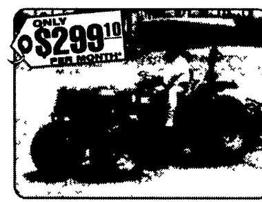
M4900SD-F - 45 PTO HP. MFD ROPS, Shuttle Shift