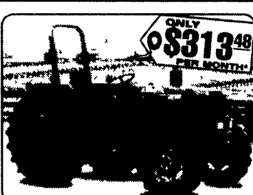
M5700SD-F - 52 PTO HP, MFD ROPS, Shuttle Shift