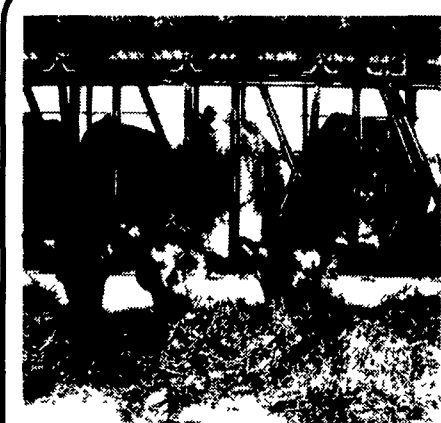
Auto Release Self-Locks