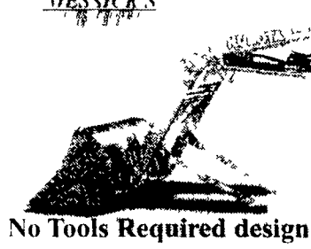
No Tools Required design

Buy NOW at 0% 36 months* financing *some restrictions apply