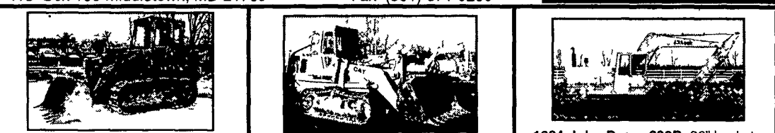
1995 Cat 953B, cab/a c, 4 in 1 or gp bucket, v g undercarriage, fresh paint, work ready, $72,500 1989 Cat 963LGP, factory cab, gp bucket w/teeth, v g undercarriage & condition, work ready, $44,000 1984 John Deere 690B, 36" bucket, standard stick, joystick controls, v g undercarriage & condition, work ready $19,000