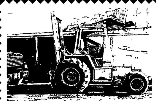
Allis 706C 6,000 lb. 22 Ft. Forklift $8,000

Heavy Equipment Loader Parts RT 22 Grantville, PA (717) 469-0039 help10070.com