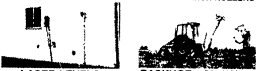
LASER LEVELS BACKHOE w/HAMMER