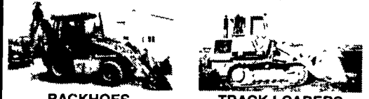
BACKHOES TRACK LOADERS

Contractors, Business Owners, Farmers & Others You Don't Have To Buy Excavating Equipment For Your Jobs Rent From Us For Less!