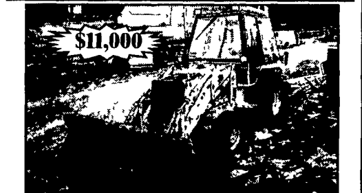
1988 JCB 1400B, 4WD, Cab, Extenda-Hoe, Runs and Operates Well. Maybe could be painted soon Located in Lanc Cty 410-688-2739