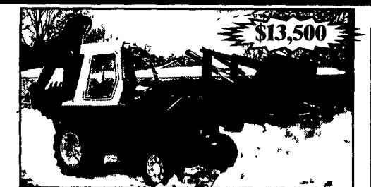
1987 Case 580 Super E: 4WD. Cab, Extenda-hoe. 5500 Original Hours, 80% Rear Tires, Excellent Brakes, Good Runner Located in Lanc Cty

Heavy Equipment Loader Parts RT 22 Grantville, PA (717) 469-0039 help10070.com