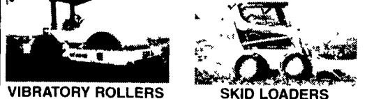
VIBRATORY ROLLERS SKID LOADERS