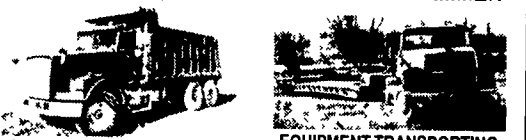
DUMP TRUCK HAULING EQUIPMENT TRANSPORTING