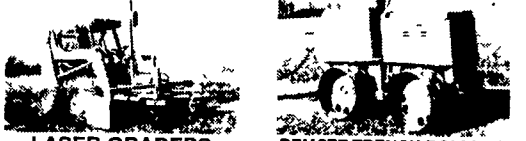
LASER GRADERS REMOTE TRENCH ROLLERS