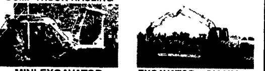
MINI EXCAVATOR EXCAVATOR w/HAMMER