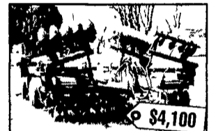
C 32084 IH 501 Disc 20 6 Cut 13 6 Transport Width Center Duals Cylinder & Hoses Scrapers Blades Front 22 5 Rear 22