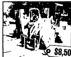
C 32247 Case W4 Loader W/Forklift & Bkt, 1920 Hrs MFD, ROPS Diesel 4 Cyl 12 5x15 Frt & Rear Tires 60 Bucket Rebuilt Engine