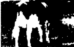
Dar-el Emory Mae VG 86 2 9 2X 365 26 324 3 3 870 Fresh Dec serviced to Roy Sells bred to Marty