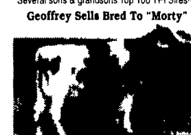
Hem View Fan Fry VG86 3 1 353 28 324 3 6 1039