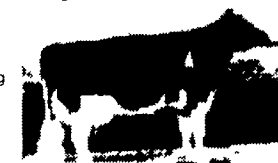
Hem View Chief Mark Jolene 3E91 DOM 5 03 351 26 880 3 8 1028 by Mark from VG Tony GrDam VG Jet Stram Several sons & grandsons Top 100 TPI Sires!

4 Milking Dau's and Several Grdau's Sell!