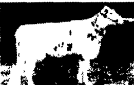
Ellbank Duster K Maya - ET 2 0 3 330 24 566 3 3 805

Duster Sells from "Airliners" Full Sister