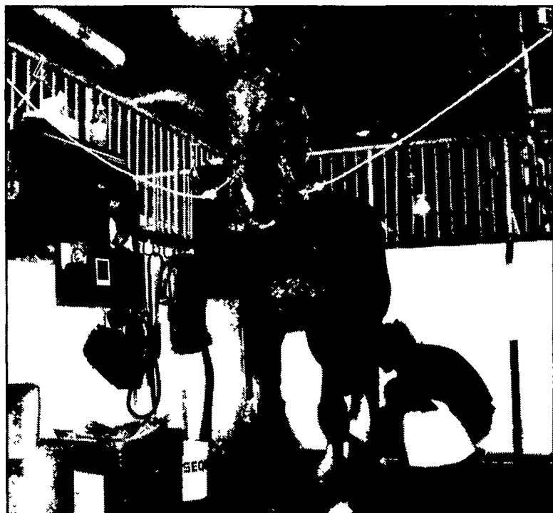
Amy DeVisser, Cazenovia, N.Y., readies "Puma" for a speed class.