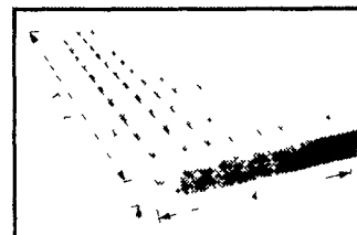
Cattle "Waffle Slat"