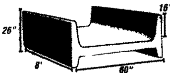
High Capacity H-style Feed Bunker