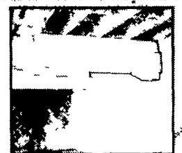
Keystone Knuckle Beam System helps support pit wall (NCRS approved)