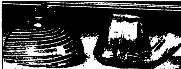
Some American 19th century sandwich glass inkwells can be classified as works of art.