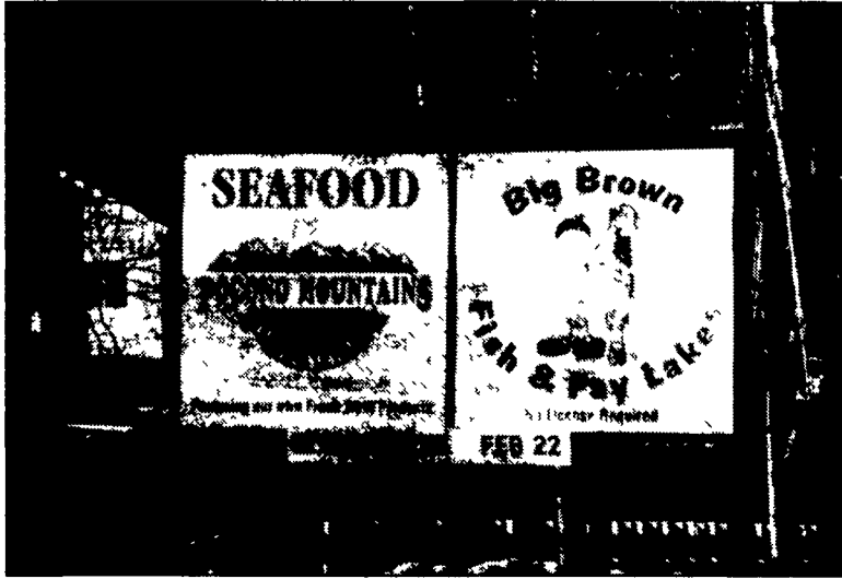
This sign welcomes customers to Big Brown Fish Hatchery and Fish and Pay Lakes, Effort, where customers can enjoy catching large trout and bass raised at the hatchery.