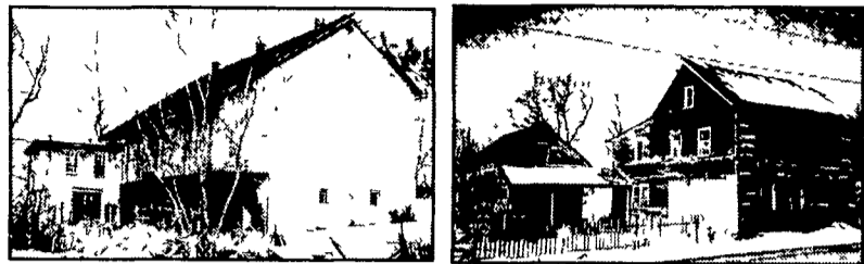
EARLY PENNA. GERMAN LOG FARM HOUSE AND BARN Circa 1765-75

Located on a quiet 2 1/2 acre lot with spring and pasture on a maintained street in the historic community of Schaefferstown, Penna., this early dove-tailed log home presents evidence of a large 11 foot fireplace with a central chimney. An extremely rare and unusual feature includes evidence of paint decorated interior logs and chinking. The second floor provides wide oak flooring and evidence of an unusual "sleep-closet" beside the massive fireplace chimney. Four rooms made up the original 18th century portion of the house with a later, perhaps also a late 18th century, addition. A pleasant semi-attached summer house completes the dwelling.