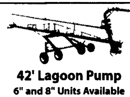
42' Lagoon Pump 6" and 8" Units Available