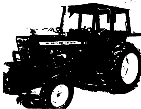
Ford 5000 Diesel 68 HP Cab New Paint Ex Cond $7,500 717-375-2582

1996 CIH 1666 Combine, Ex. Cond. 1063 Corn Head, 1020 20 ft. Flex Head, (2) Head Carriers. MUST SELL 5140 CIH Tractor w/Loader, 2000 Hrs. 484-614-0788