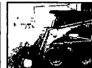
Case 1845C, 2001 YEAR, 2000 HOURS $14,900 (C2696C)