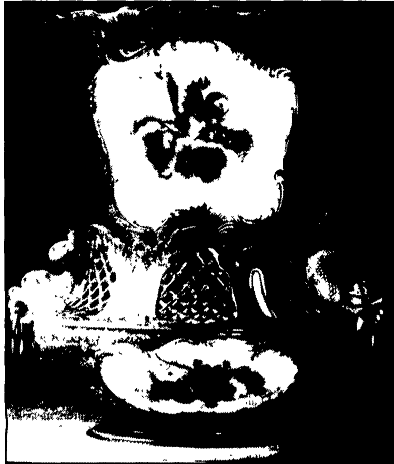
Sevres vase made in Vincennes, 1755. Signed and marked by Charles Nicolas Dodin.

If you like the look but can't afford the real thing, there are plenty of 19th century look-alikes waiting to be discovered at estate sales. Don't pay too much.