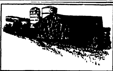
First Time Ever!!! Exclusive Limited Edition Print The Barn Each print is individually signed and numbered on 8 1/2 x 11 heavy stock, for $25.00 each.