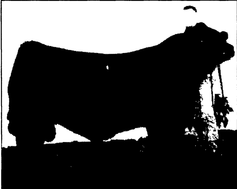
"Power Surge" was Simmental bull grand champion.

HARRISBURG (Dauphin Co.) — Power Surge made his mark at the 2003 Pennsylvania State Farm Show. This Simmental bull was named grand champion.