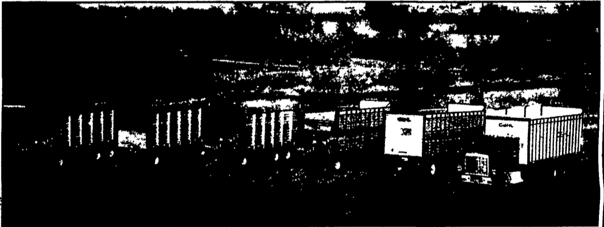
Four new models offer agricultural producers the variety and dependability needed to harvest high quality forage. The Gehl line consists of the 1620 Front Unload, the 1640 Rear Unload, the 1660 (and open-roofed 1660HD) Front and Rear Unload and the 1840 Rear Unload Forage Max.