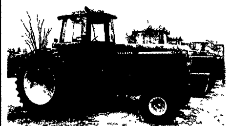
92 JD 4960, 2WD, 3125 HR., 200 HP, 15 Speed Power Shift, 3 Hyd. Remotes, Full Set Front Weights, Rear Wheel Weights 20.8 R42 with Duals $45,000