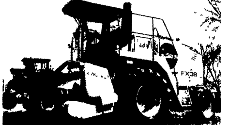
00 FX 38 New Holland, 4x4 Corn Cracker, 700 Cutter Hr, 900 Engine Hr, Hyd Outlets, 6 Row Corn, 10 Hay $176,000 $159,900