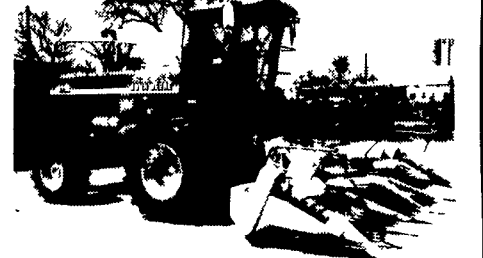
01 JD 6750 4x4 Corn Cracker, 200 Hr, 10' Hay Head, 6 Row Independent Corn Head $180,000 $173,000