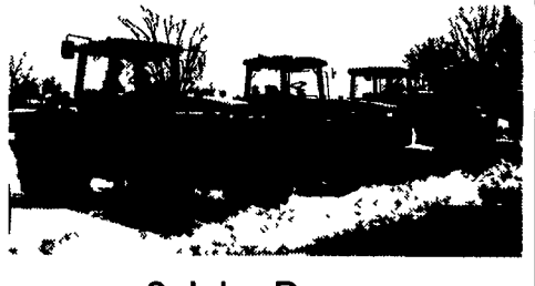
3 John Deere 8310 Tractors In Stock