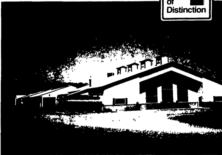
Pictured is the Kulp Family Dairy, Blair County, one of Pennsylvania's Dairies of Distinction for 2002.

Roadside judging will take place in May. Judges will look at factors that can be controlled by the farmer, such as clean and attractively finished buildings; neat landscaping, ditches, roads and lanes; and well-maintained fences. They also will take into account other aspects of the farm, such as cleanliness of animals, the barnyard, feed areas and manure management.