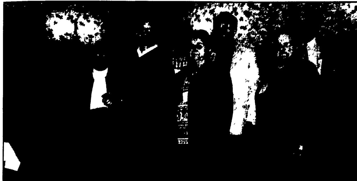
This year's outstanding Young Farmer Chapter Award went to the Solanco Young Farmer Chapter.