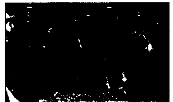
As Belgians were auctioned off in the Large Arena, owners exhibited their Haflingers — hitched or ridden — to prospective bidders in the northwest barn.