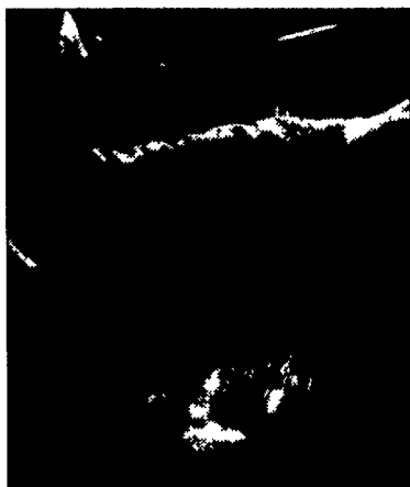
Preparations also include putting a gel-like substance on the filly's mane to keep it from looking too flyaway.