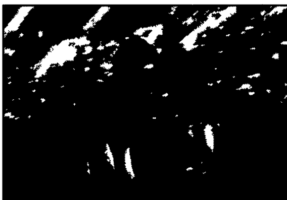
A Belgian goes through the ring during the sale.