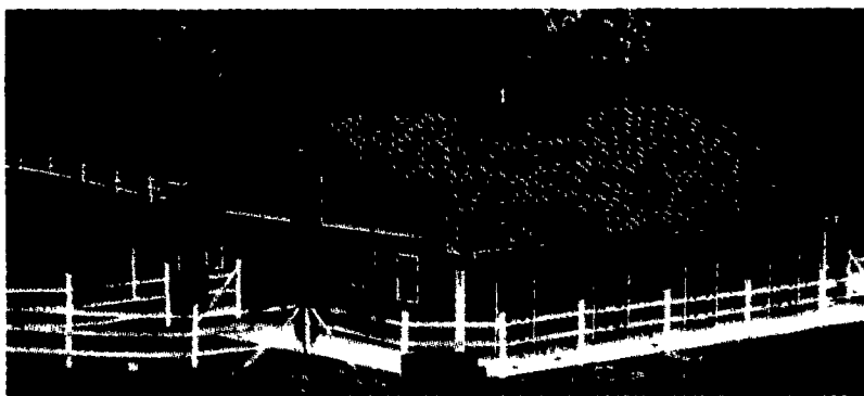
Complete Building Packages, Trusses And Glue-Laminated Timbers

717-866-6581 701 E. Linden St. Richland, PA 17087