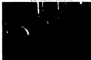
Pasture Mat and PM Plus installation in an old tie stall barn.