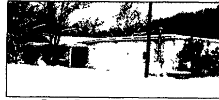
Former Estate of Benedict J. Cerven

26,000 Sq. Ft. Building Simpson Street • 2.065 ± Acre Parcel • Public Utilities • 70+ parking spaces • Open Zoning • Absolute at $99,900