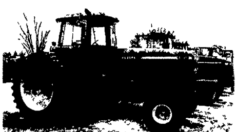
92 JD 4960, 2WD, 3125 HR., 200 HP, 15 Speed Power Shift, 3 Hyd. Remotes, Full Set Front Weights, Rear Wheel Weights 20.8 R42 with Duals $45,000