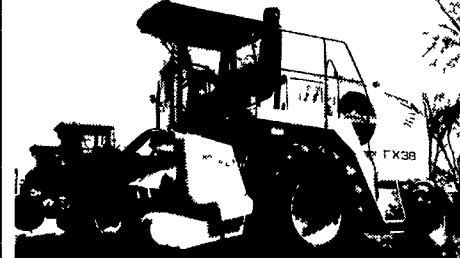
00 FX 38 New Holland, 4x4 Corn Cracker, 700 Cutter Hr, 900 Engine Hr, Hyd Outlets, 6 Row Corn, 10 Hay $176,000 $159,900