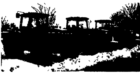
3 John Deere 8310 Tractors In Stock