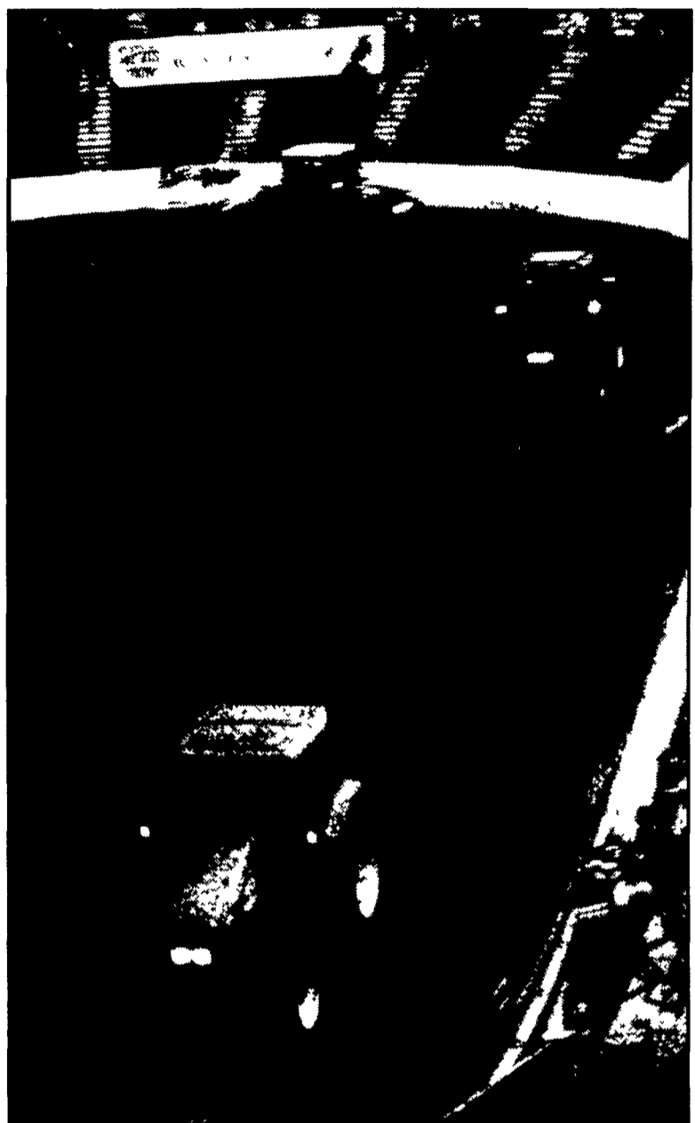
Agco staged tractor and tedder demonstrations in the Large Arena at the Farm Show Complex early this week, during Farmer Days.