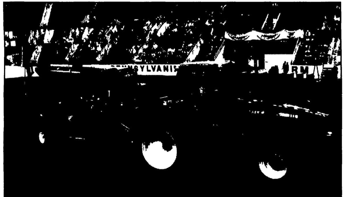
Hooper Inc. also demonstrated this Great Plains 2010P 20-foot drill hooked up to a Case Magnum MX210 180-hp tractor.