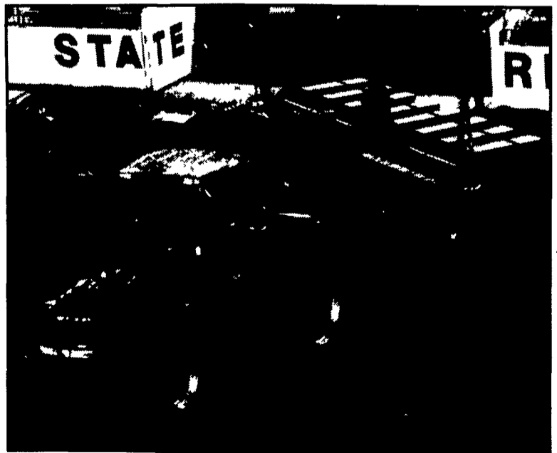
Hooper Inc. demonstrated this Case IH 8-row 1200 ASM planter during Farmer Days.